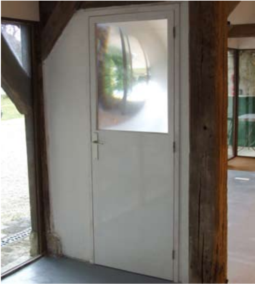
Porte de Fresnel , 2007. Collection and courtesy of Laurent Duthion © Katalina Quijano 2007.