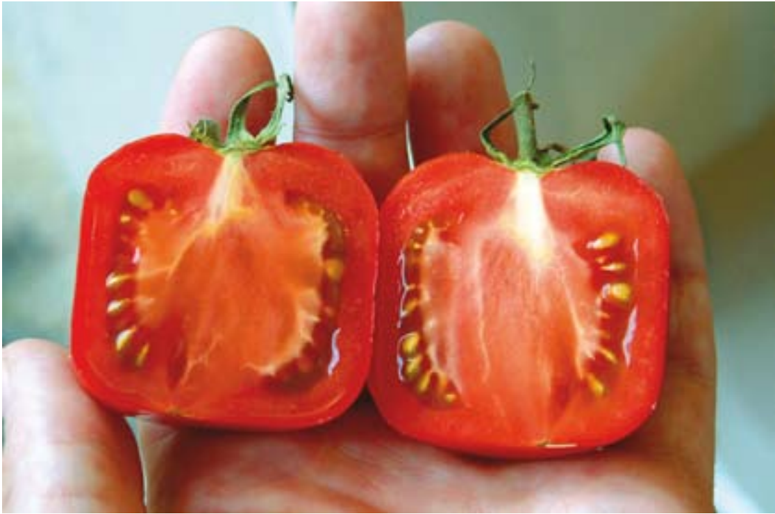
Paradajz , 2004, tomatoes. © Laurent Duthion 2004.