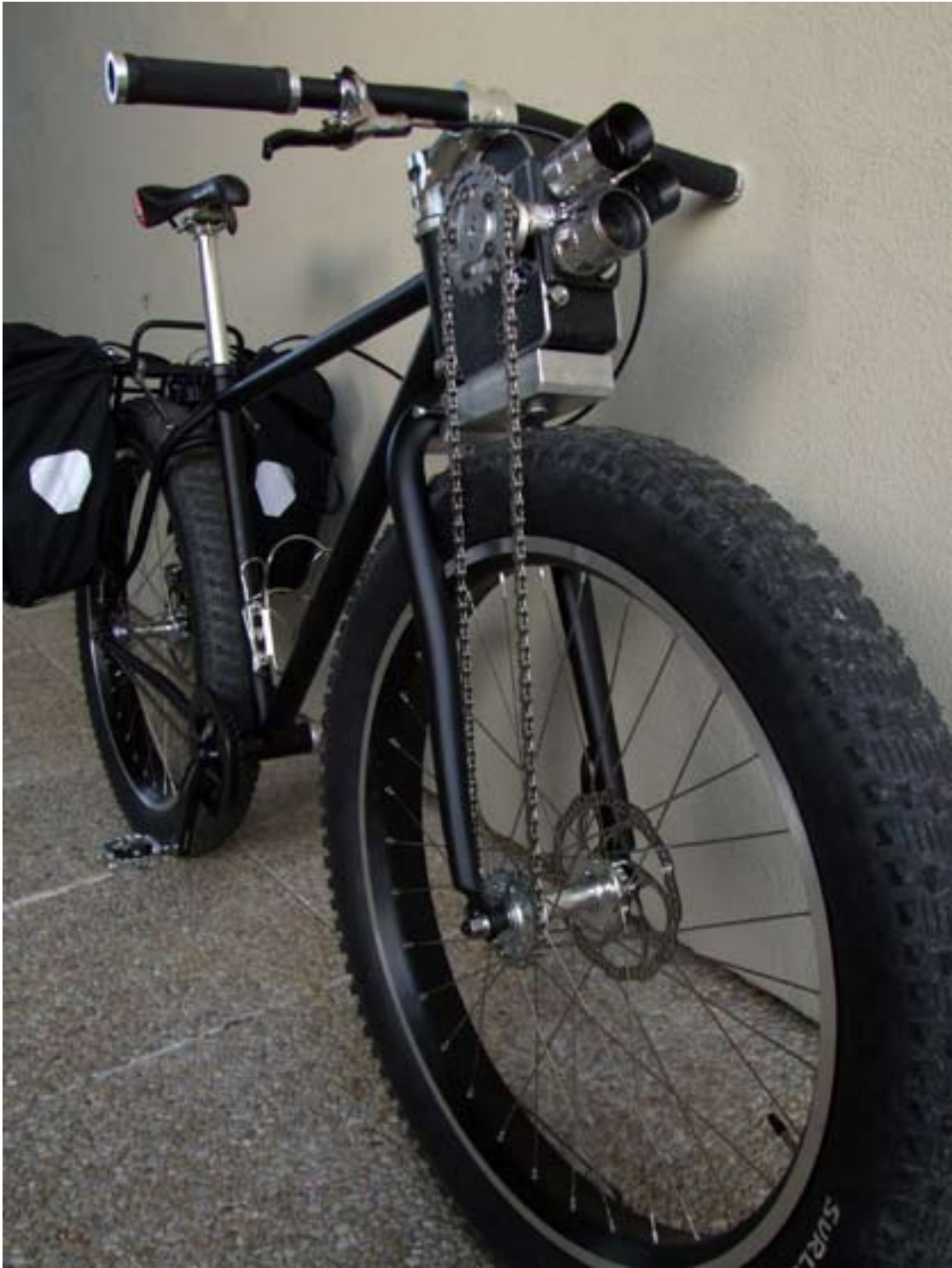
Bolex-mobile , 2008. The first film will be made during a single-handed trip on the Arctic ice pack.