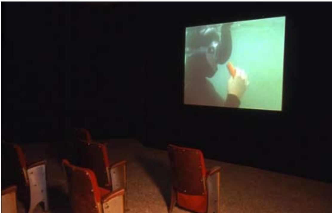
Screening of the film of the first test of Aquarhine , at the Galerie du Dourven.