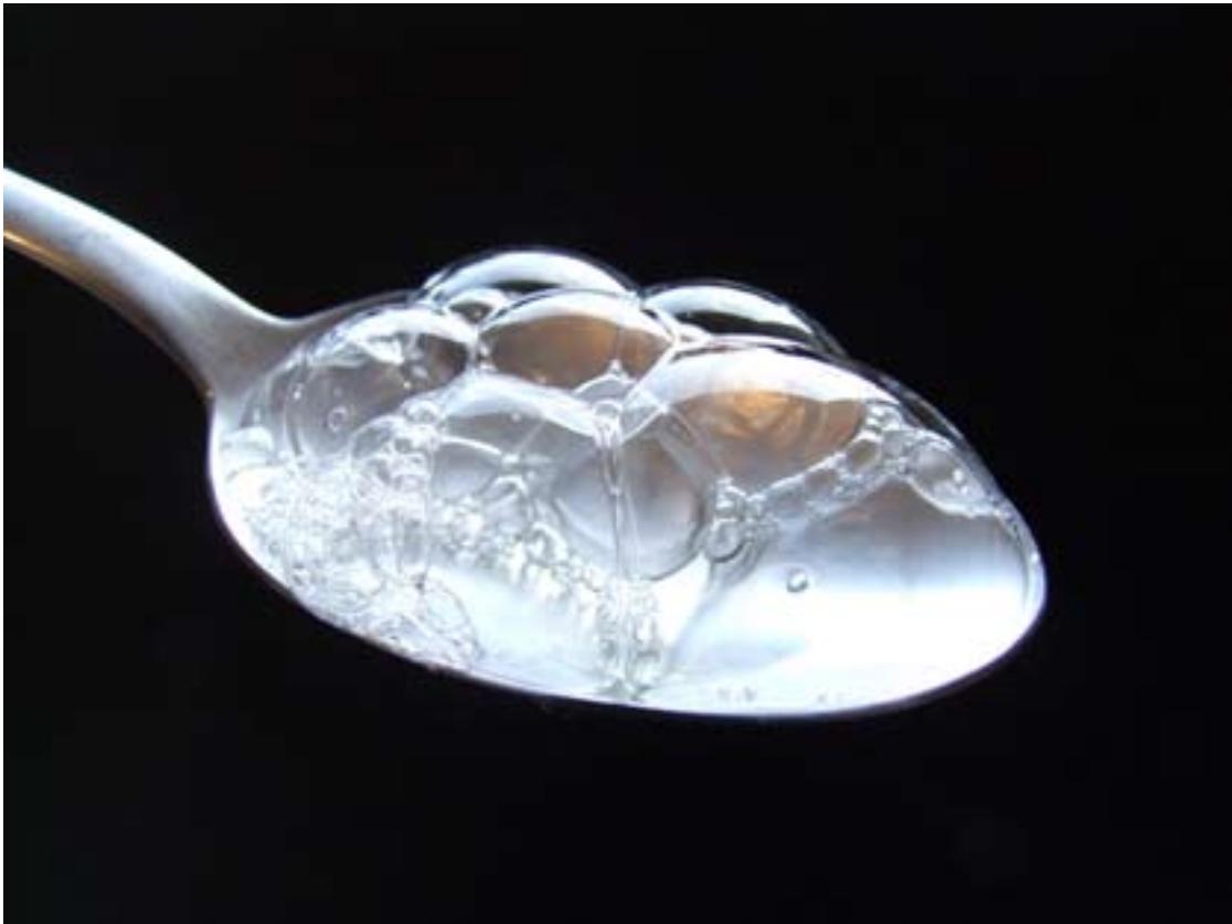
Gaz adélie (culinary version) , 2008, © Laurent Duthion 2008.